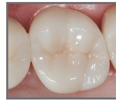
BruxZir 3Y 2009 Initial Placement

Over 200 tooth-colored materials have been studied clinically by this lab over the last 40+ years. The current study includes 20 materials at various stages of clinical service ( see listing on page 2 ). The materials differ in many aspects, but all are tooth-colored, monolithic, CAD-CAM fabricated either by commercial labs or in-office; all were recommended for single units anywhere in the oral cavity when entered into this study; and all study restorations are full-contour crowns on molars.