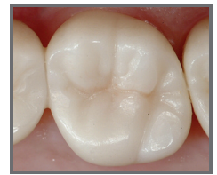
BruxZir 3Y At 8 Years (Note loss of glaze)